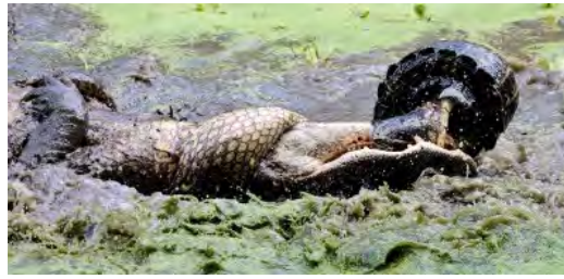
Death roll with tail bite