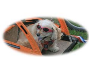
A parade participant in shades

On Sunday, July 3, BBSPVO hosted the 13th Annual Independence Day Bike Parade at the park. Volunteers helped kids decorate bikes, rode in the parade, and served refreshments of lemonade, frozen pops and watermelon after the parade. The parade was about 2 miles long.