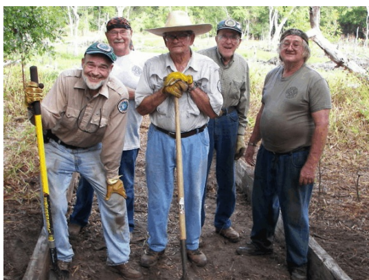
Creekfield Platform crew