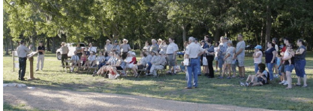
Crowd at Dedication