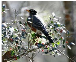
American Robin

What: The 14th Annual Great Texas Birding Classic