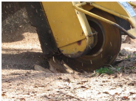
Grinding Stumps Below Ground