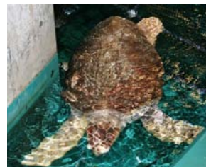
400 Lb. Loggerhead Turtle